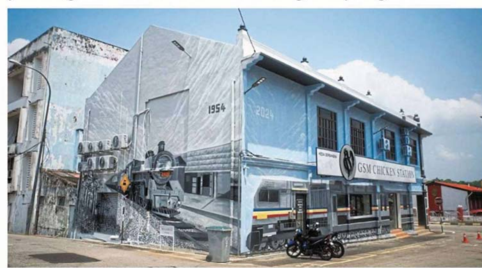
The 10.4m high and 12.5m wide 'Train Across Time' artwork has made it into the Malaysia Book of Records for the largest train wall mural.

Mural at eatery a visual narrative of passage of time and technological progress